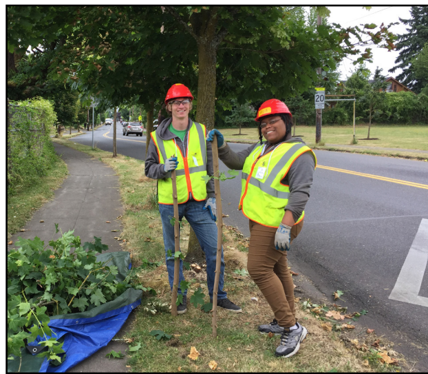
Tree Crew: trees, science & health