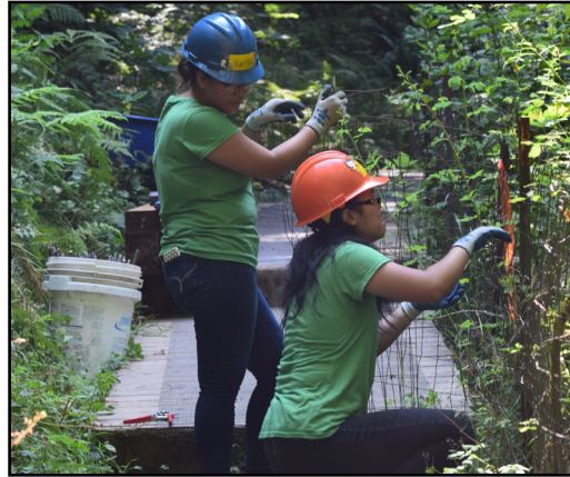
Trail Crew: build engineering & construction skills