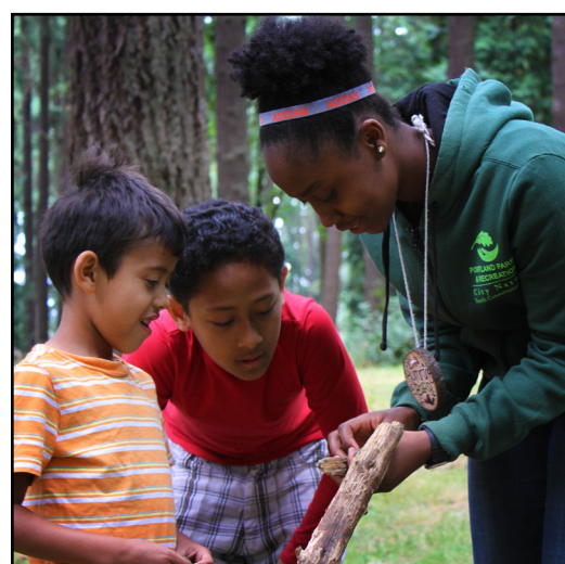
Teen Naturalist Team: teach kids about nature